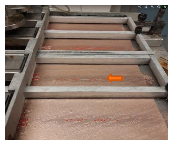
Figure 16. 399 brushes. Coating is slightly punctured and white base appears in basic brushing. Loose coating precipitation begin to accumulate at the ends of the brushing path.