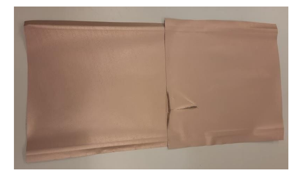
Figure 11. Test 2. Membrane with additive 4000 brushes. No visible changes on the membrane surface.