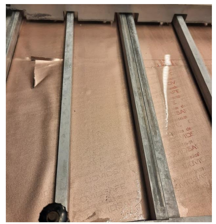
Figure 10. Test 2. Membrane with additive 3000 brushes. The membrane is torn at the tape seam. No visible changes on the membrane surface.

Figure 9. Test 2, additional weights on the basic membrane brushes. Basic membrane 2000 brushes. In the basic membrane, the surface is broken at the embossed letters on the brushing path. On the right side, the white base for a distance of approx. 10 cm is also exposed on the brushing path.