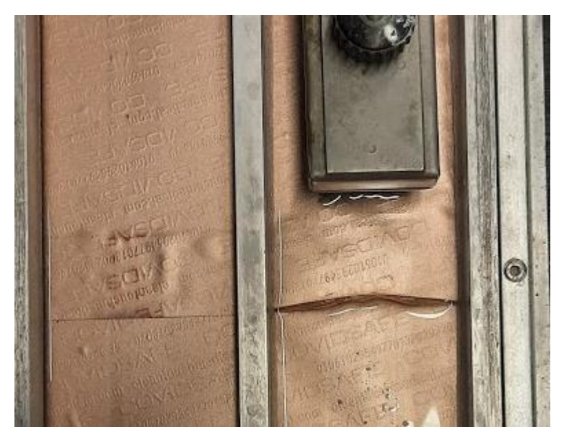
Figure 4. Test 1. Basic membrane at the seam after 600 brushes.

Figure 3. Test 1. Membrane with additive on the left and basic membrane on the right. Test time 600 brushes. In the basic membrane, red text appears at the seam. No visible changes in the membrane with additive.