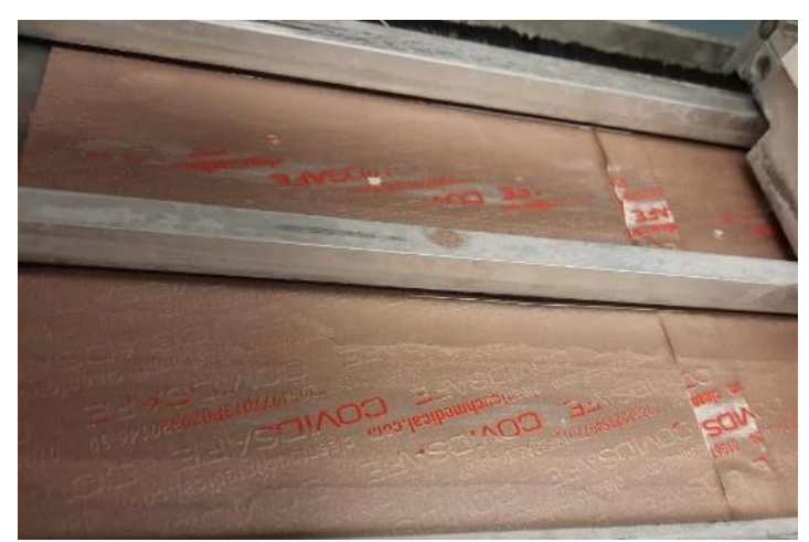
Figure 15. 360 brushes. Coating brushed with additional weights has punctured and white base is visible.

Figure 14. 200 brushes. In the part brushed with additional weights, detached coating appears precipitated on the surface.