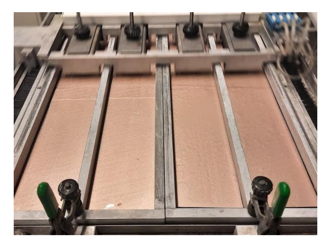
Figure 2. Test 1. Membrane with additive on the left and basic membrane on the right. Test time 200 brushes. There are no visible changes in either membrane.

Figure 1. Test 1. Samples 1 and 2 magnification. Additive used in the upper membrane, basic membrane below.