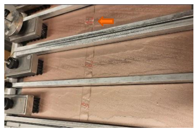
Figure 13. 133 brushes. In the basic brushing, text appears on the embossed part. With additional weights (top groove), the coating has punctured on the embossed part and the base has become visible.