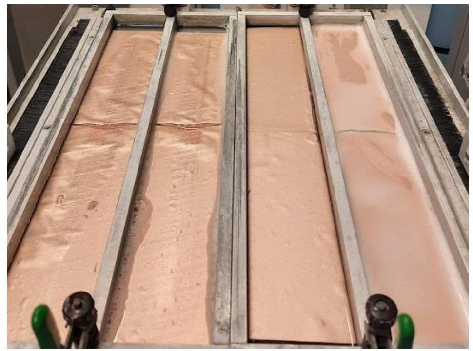
Figure 5. Test 1. Membrane with additive on the left and basic membrane on the right. Test time 1400 brushes. In the basic membrane, text begins to appear and the surface is broken at the embossed letters on the brushing path. Still no visible changes in the membrane with additive.