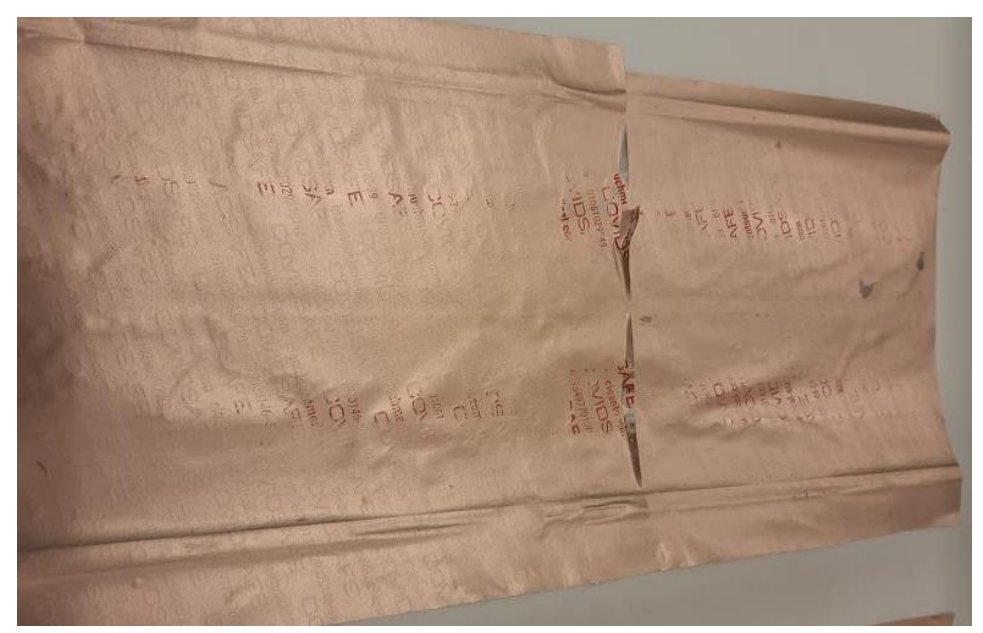
Figure 6. Test 1. Test time 2000 brushes. In the basic membrane, the surface is broken at the embossed letters on the brushing path. However, no white base visible.

Figure 5. Test 1. Membrane with additive on the left and basic membrane on the right. Test time 1400 brushes. In the basic membrane, text begins to appear and the surface is broken at the embossed letters on the brushing path. Still no visible changes in the membrane with additive.