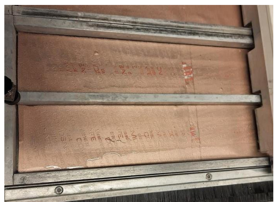
Figure 8. Test 2, additional weights on the basic membrane brushes. Basic membrane 600 brushes. In the basic membrane, the surface is broken at the embossed letters on the brushing path. The white base is exposed at the junction of the tape, which is raised from the rest of the membrane.

Figure 7. Test 2, additional weights on the basic membrane brushes. Test time 200 brushes. Surface broken at the tape seam.