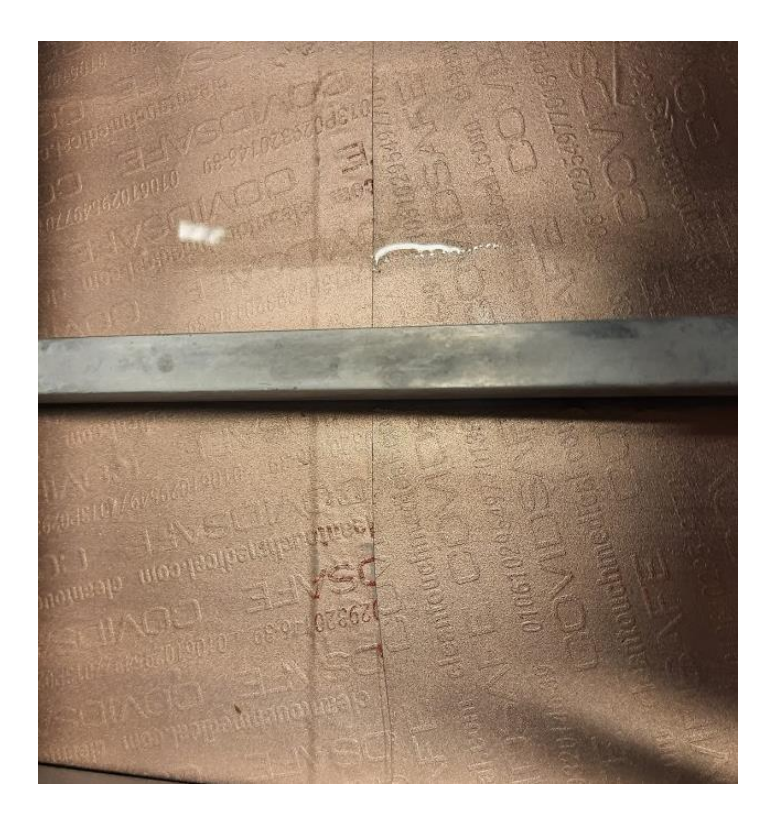
Figure 7. Test 2, additional weights on the basic membrane brushes. Test time 200 brushes. Surface broken at the tape seam.