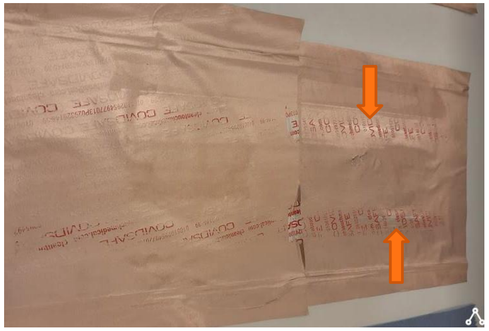
Figure 9. Test 2, additional weights on the basic membrane brushes. Basic membrane 2000 brushes. In the basic membrane, the surface is broken at the embossed letters on the brushing path. On the right side, the white base for a distance of approx. 10 cm is also exposed on the brushing path.