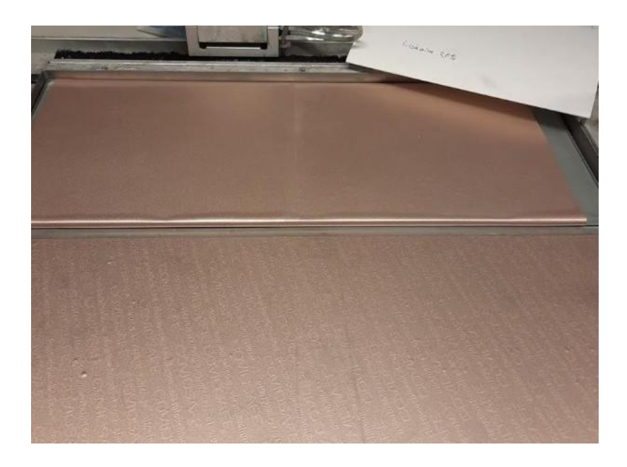
Figure 1. Test 1. Samples 1 and 2 magnification. Additive used in the upper membrane, basic membrane below.