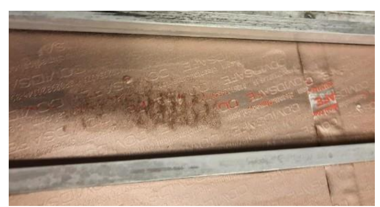
Figure 14. 200 brushes. In the part brushed with additional weights, detached coating appears precipitated on the surface.

Figure 13. 133 brushes. In the basic brushing, text appears on the embossed part. With additional weights (top groove), the coating has punctured on the embossed part and the base has become visible.