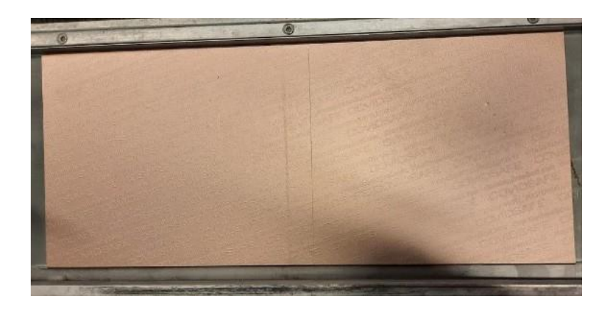
Figure 12. Starting situation.